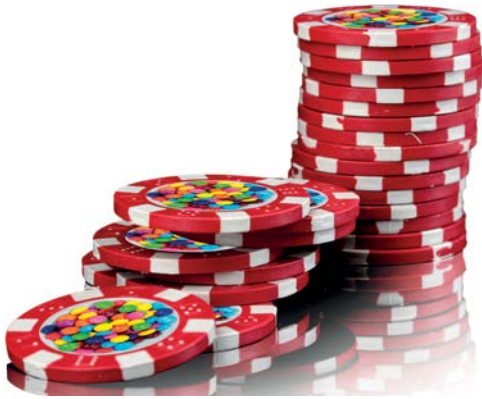
Small object printing

Detach the module to keep it out of your way while performing rigid jobs or just leave it docked, whichever is more convenient for you. The roll-to-roll system fits in perfectly with the moving gantry and allows minimal waste production while printing on flexible media.