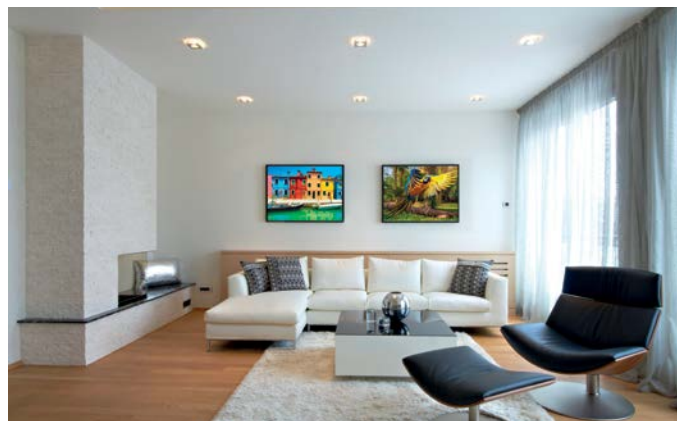
In-house decoration - dibond