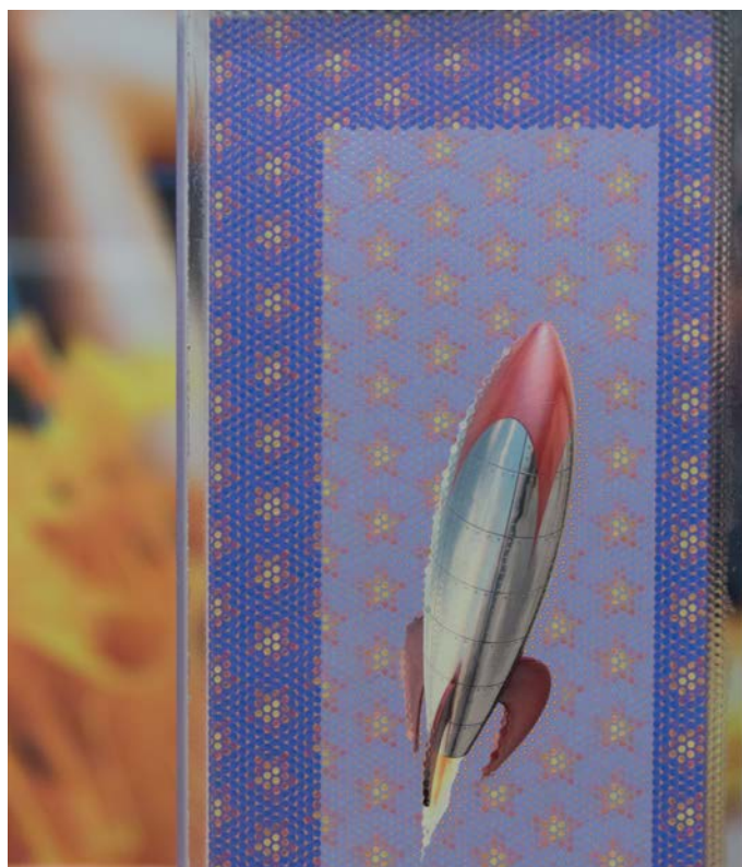
3D Lens Technology

Moreover, this 'thin ink layer' pigment dispersion technology does not mean the Jeti Mira compromises on quality. Quite the opposite is true – and not only does it result in eye-catching prints; it also helps preserve the environment and saves on your budget. In short, these inks offer the best possible price/quality ratio.