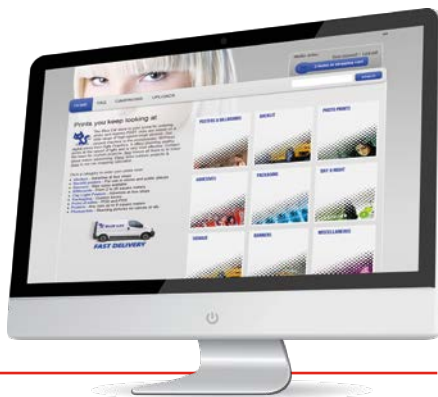
StoreFront web-to-print software