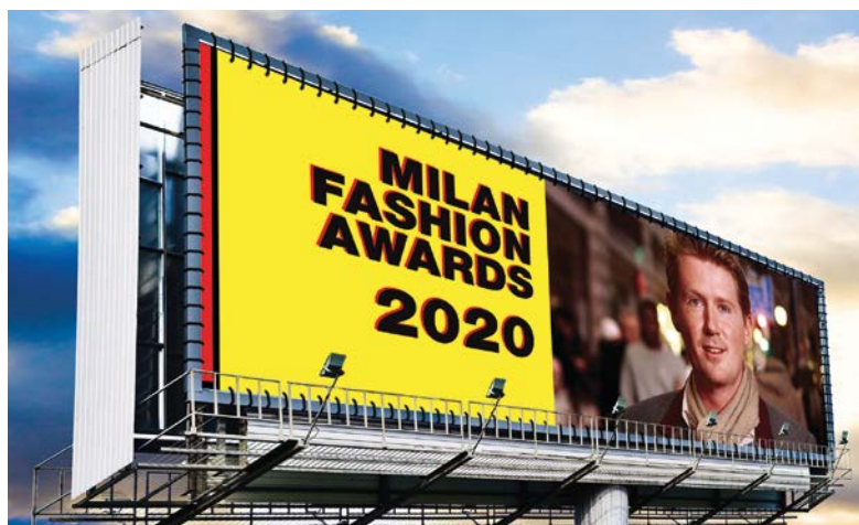
Outdoor communication – vinyl