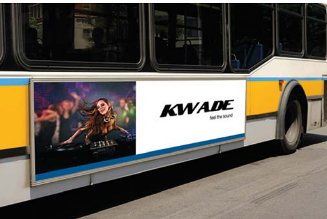
Outdoor communication – vinyl