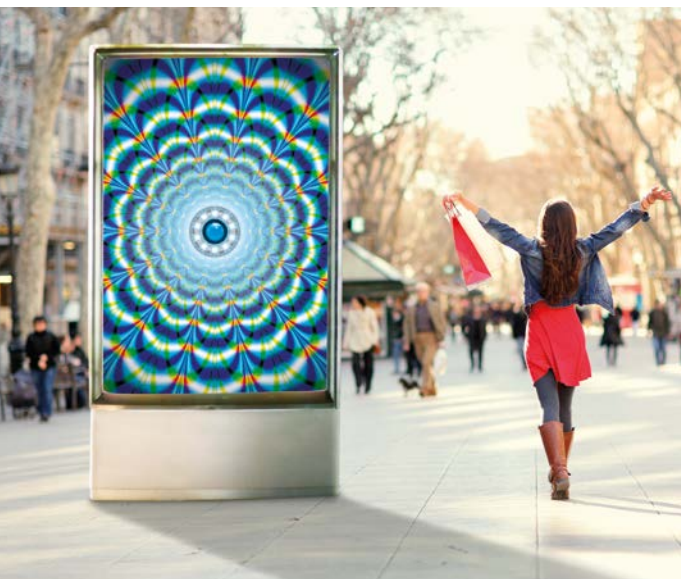
Outstanding print quality on backlit applications

Your day-to-day roll-to-roll sign & display jobs? Hand them over to your very solid Anapurna RTR3200i LED. This dedicated roll-to-roll UV LED-curable printer, which comes in a six color version and a four color plus white version, handles a broad scope of flexible media for indoor and outdoor applications.