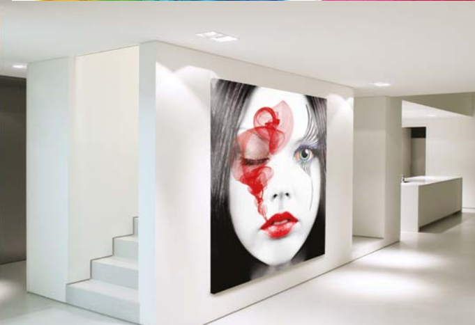
In-house decoration – dibond